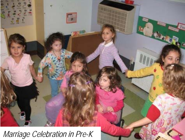
Marriage Celebration in Pre-K