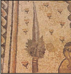
A bundle of lulav, aravot and hadassim with an etrog, on the right, in the mosaic floor of the synagogue of Hamat Tveria, dated from the 6th century BCE.