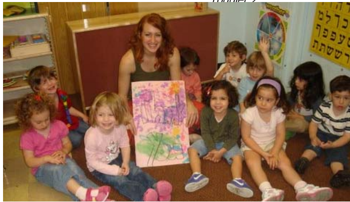
Pre Nursery 1